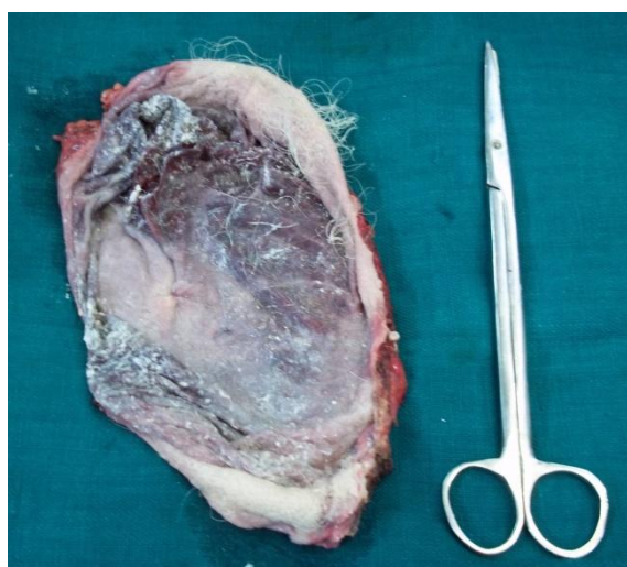
Fig.2. Cut open specimen showing pultaceous material and hair.