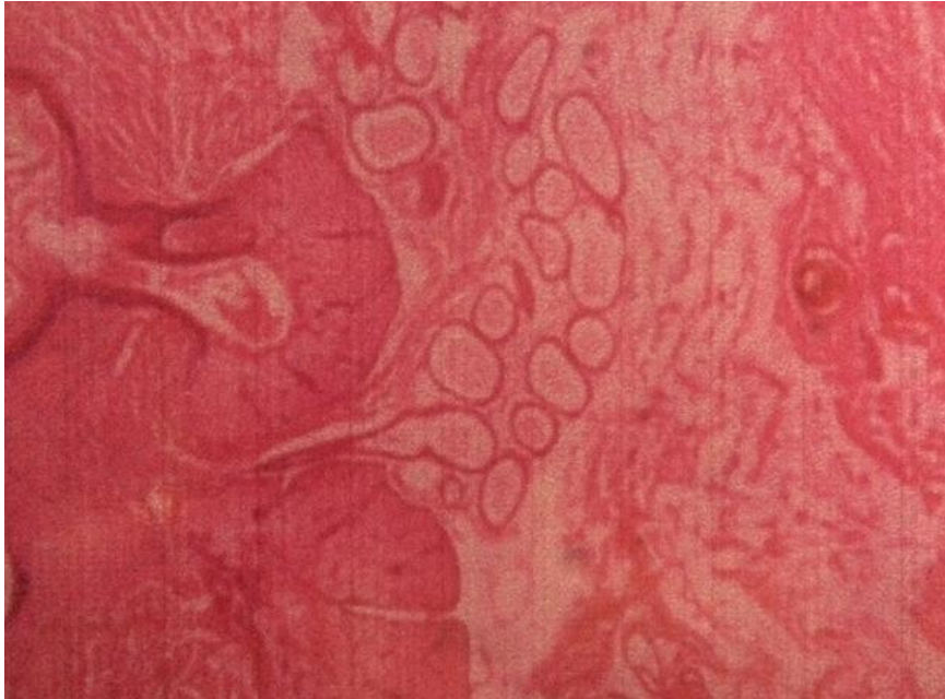
Fig.3. Histopathology showing a cystic lesion lined by squamous epithelium with skin, sebaceous glands, sweat glands and fibrous connective tissue consistent with dermoid cyst.